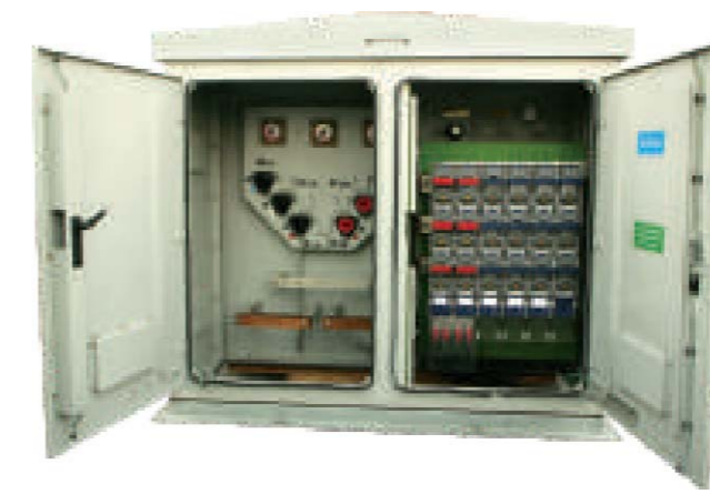
Pad Mounted Transformer Upto 1000 kVA, 25kV