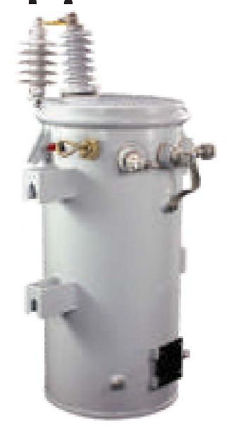
Single Phase Distribution Transformer Upto 167kVA, 33kV