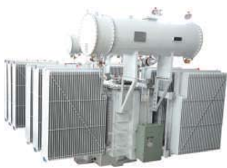
Medium and Small Power Transformer Upto 31500 kVA, 66kV