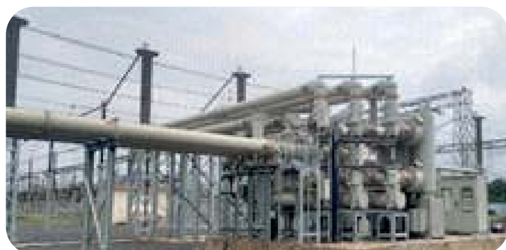
380-420 kV GIS