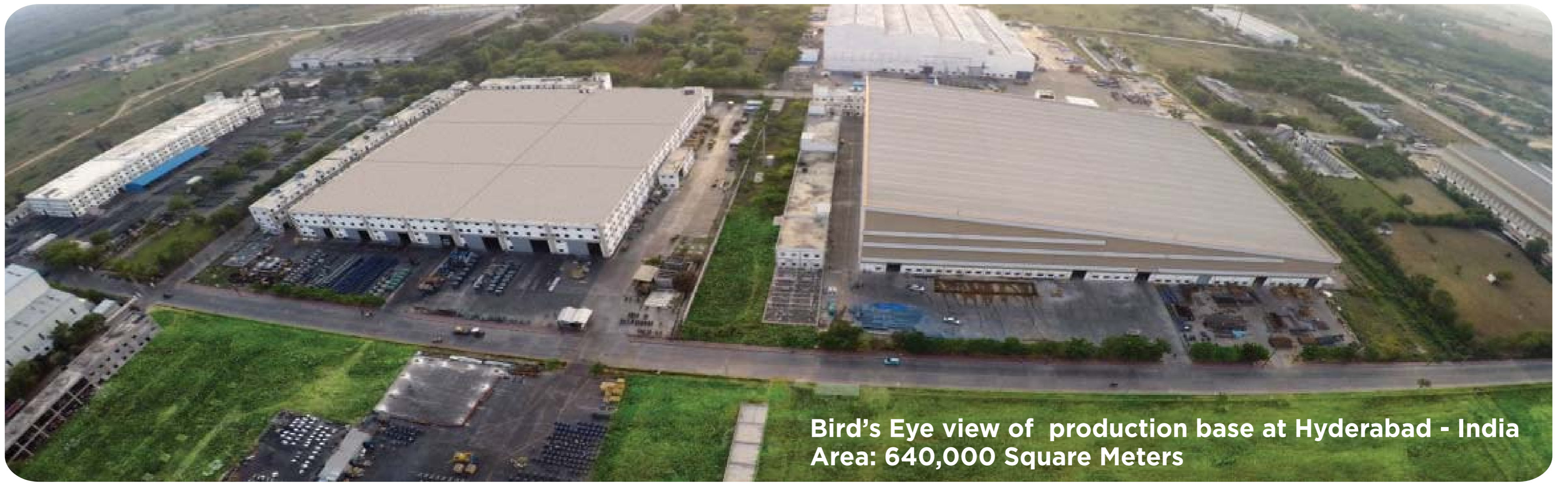
Bird's Eye view of production base at Hyderabad - India Area: 640,000 Square Meters