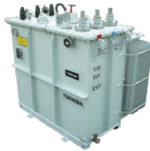
Underground Three Phase Distribution Transformer Upto 1000 KVA, 24KV