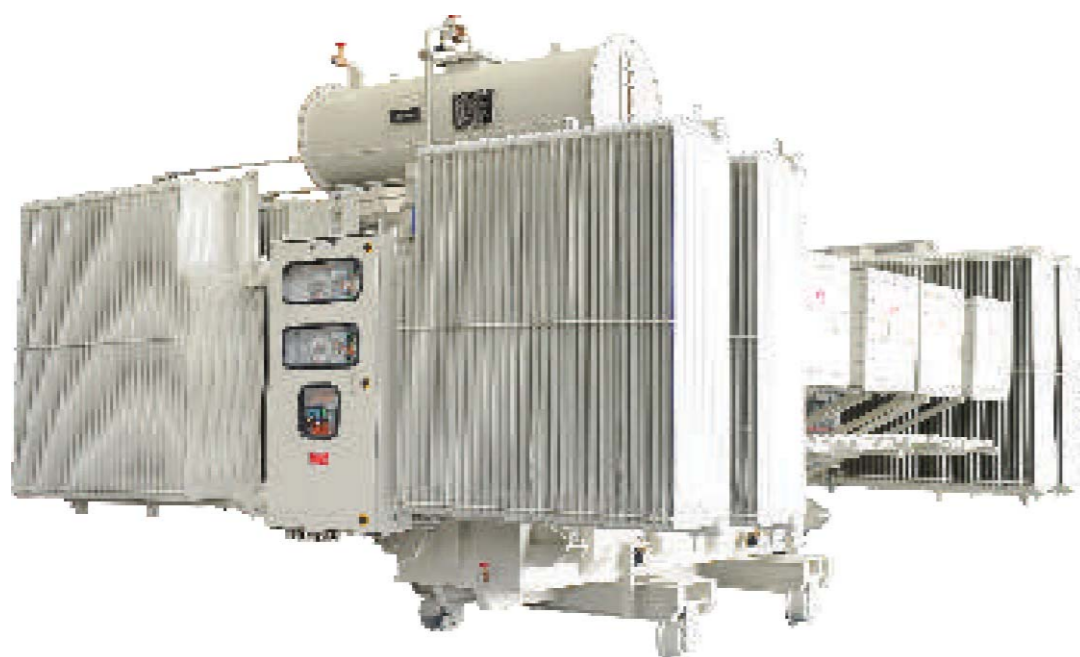
5 Windings, 20 MVA