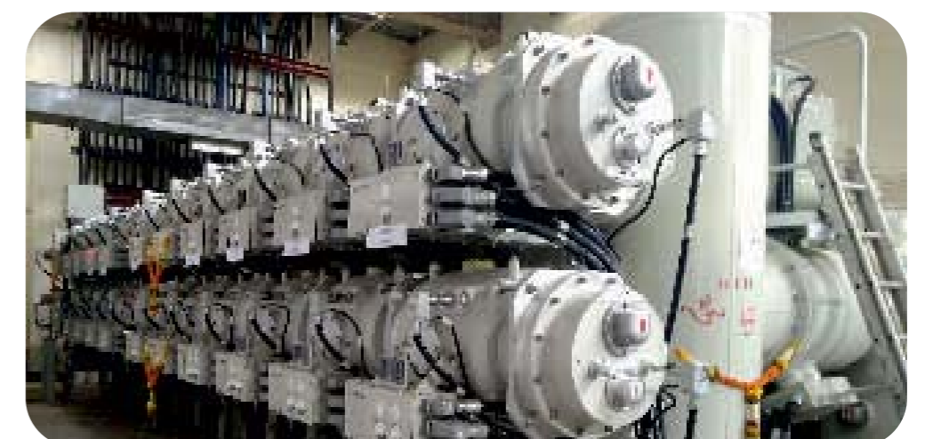
Indoor 132 kV GIS