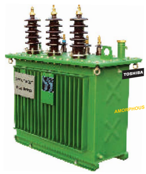
Three Phase Distribution Transformer Upto 4000 kVA, 33kV