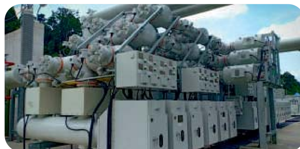
Hasang 245 kV GIS