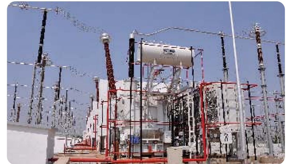
Upto 1500 MVA, 1200kV