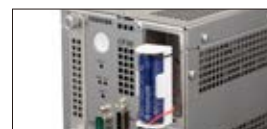
Replacement of a CMOS battery