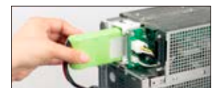
Replacement of an OS shutdown battery