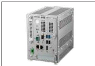
DC power supply model

The CP30 model 300 is available in models with a DC power supply (rated supply voltage: 24 VDC) or an AC power supply (rated supply voltage: 100–240 VAC).