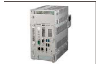
AC power supply model with an OS shutdown battery