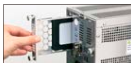
Replacement of an SSD unit