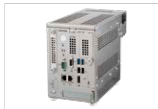
AC power supply model