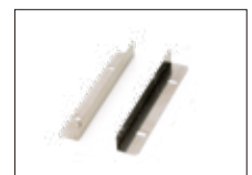
Chassis fixing stand (optional)