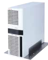
Vertical Installation (standard) The stand is an optional part.

Vertical or Horizontal to Make Effective Use of Your Space