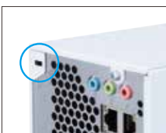
Security lock slot