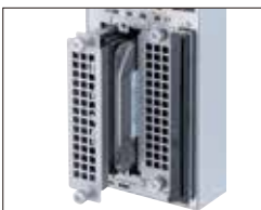
Front-end Replacement of Storage Devices