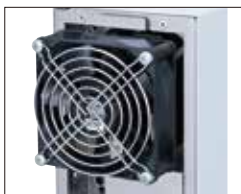
Front-end Replacement of Cooling Fan