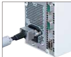
AC Power Cable Clamp