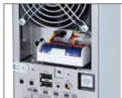
Front-end Replacement of Battery

Vertical or Horizontal to Make Effective Use of Your Space