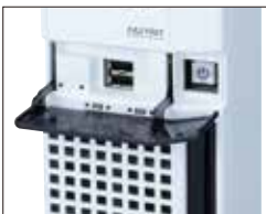
Front switch cover