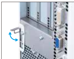
Main unit lock bracket