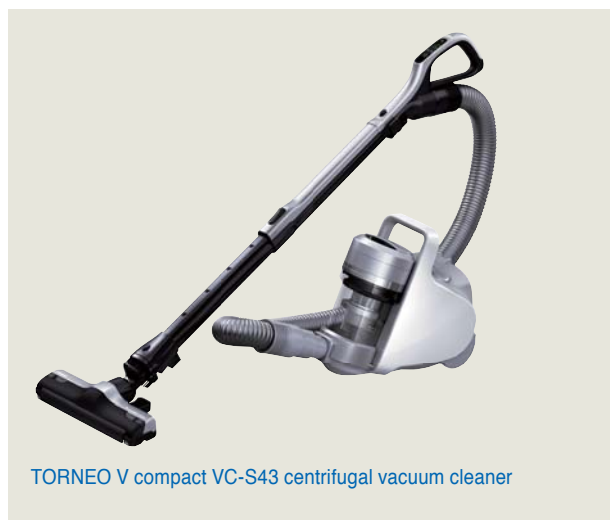
TORNEO V compact VC-S43 centrifugal vacuum cleaner

(*) Confirmed based on the voluntary standards of JEMA.