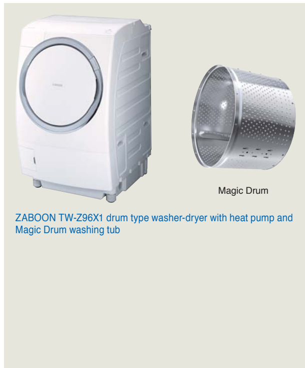
ZABOON TW-Z96X1 drum type washer-dryer with heat pump and Magic Drum washing tub