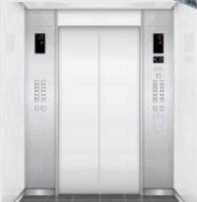
ELEXCIA™ high-speed elevator