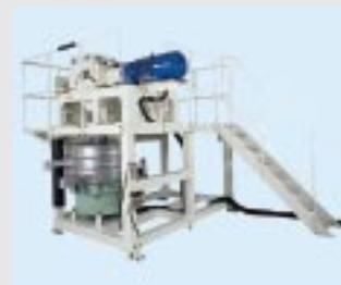
POWDERMAN™ micro-grinding machine