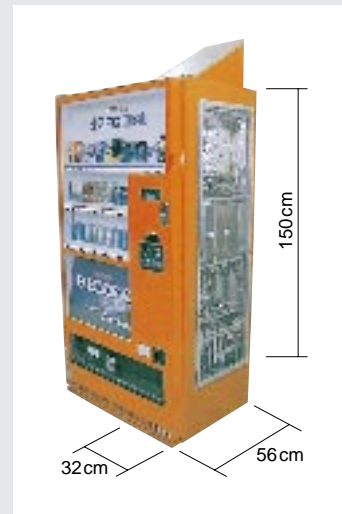
Vending machine with PEFC as a power source

The 1 kW class unit is expected to be applied to residential and portable FC units.