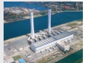
Overview of Chiba Combined Cycle PS of Tokyo Electric Power Co., Inc.