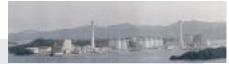
Overview of Tachibanawan PS of Shikoku Electric Power Co., Inc. and Electric Power Development Co., Ltd.

Toshiba has been supplying several world leading thermal power units with the latest technology to improve efficiency as well as to reduce their environmental impact. The following large thermal power units in the commissioning stage apply ultra supercritical steam condition: