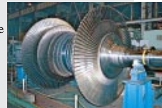
LP turbine rotor for Callide PS

In the overseas market, a 420 MW, 25.1 MPa, 566/566 °C unit has been shipped to Queensland, Australia in December 1999 and was followed by the shipment of the second unit in June 2000. This is the first export unit from Toshiba for a supercritical application. Commissioning is scheduled to start in January 2001.