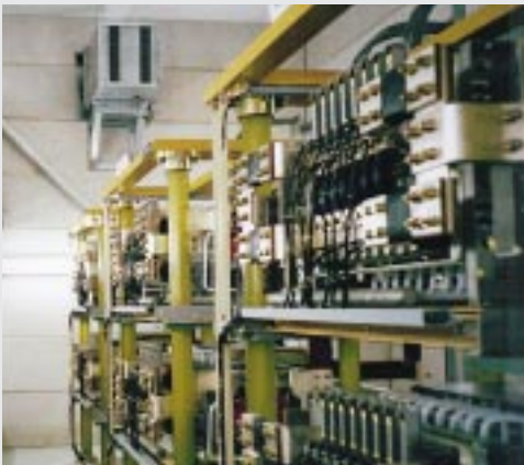
Thyristor valve for Lismore Substation 250 MVA SVC

The SVC has been in operation since November 1999 and has provided voltage regulation and has contributed to voltage stability in the power system supplying the Far North Coast of NSW during peak load conditions in the recent Australian summer.