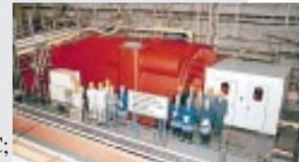
Overview of Hekinan Thermal PS No. 4 generator of Chubu Electric Power Co., Inc.