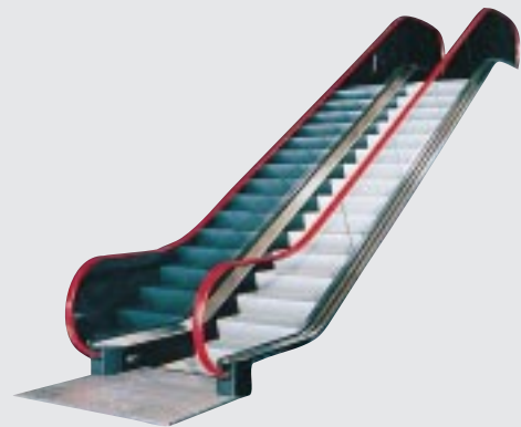
TD series escalator

* In comparison with Toshiba's conventional products.