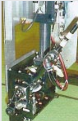
Laser peening irradiation head